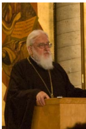
Metr. Kallistos Ware